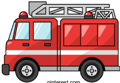
Fire truck