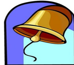
clipart-library.com Church bell